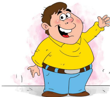
He is a pleasant boy.