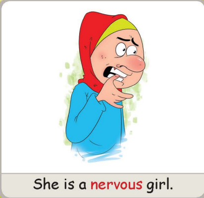
She is a nervous girl.