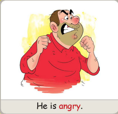
He is angry .