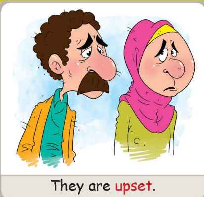
They are upset .