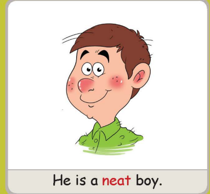
He is a neat boy.