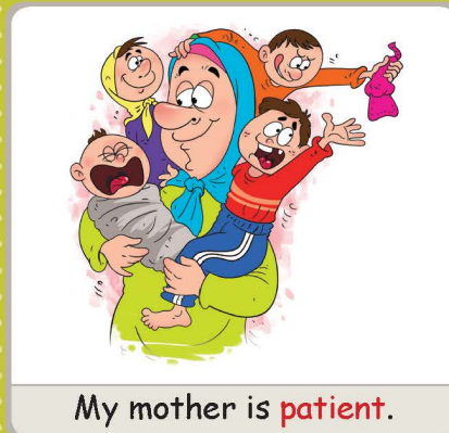
My mother is patient .