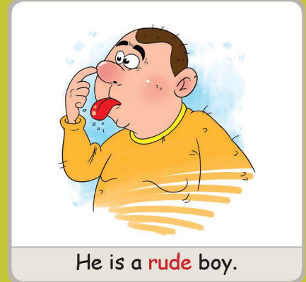
He is a rude boy.