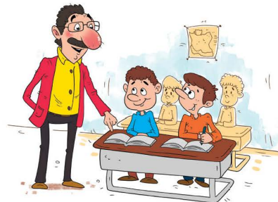
He is a kind teacher.