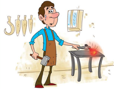
I am hard-working .