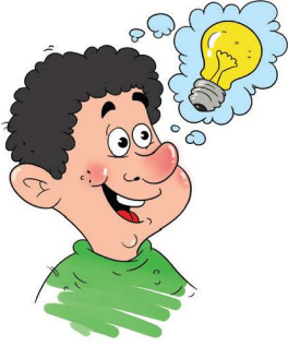
He is clever .