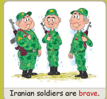
Iranian soldiers are brave .