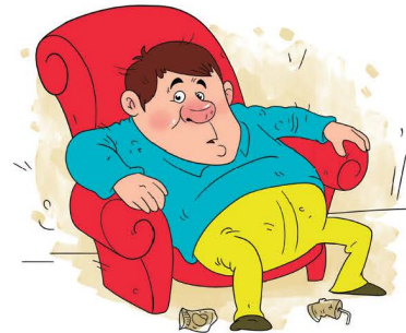
He is a lazy person.