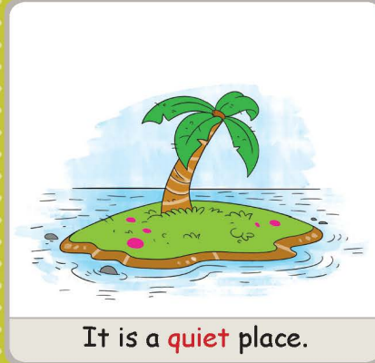
It is a quiet place.