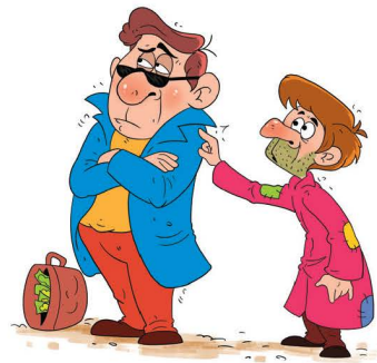
He is selfish .