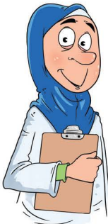
She is a helpful nurse.