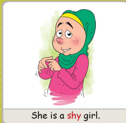
She is a shy girl.