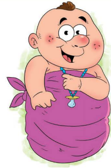
The baby is friendly .