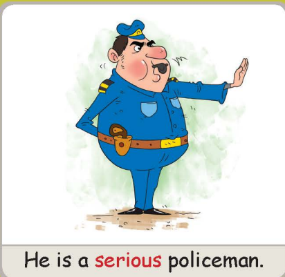
He is a serious policeman.