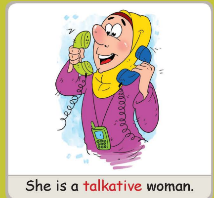
She is a talkative woman.